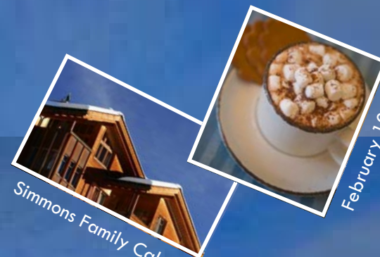
Simmons Family Cabin